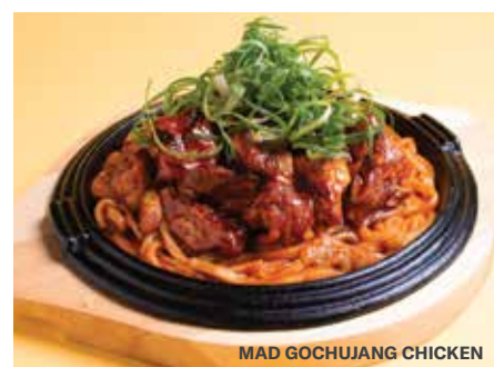
MAD GOCHUJANG CHICKEN