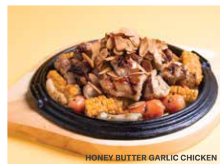
HONEY BUTTER GARLIC CHICKEN